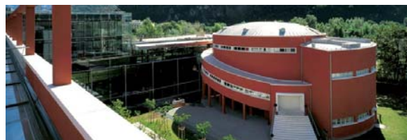
The venue: EURAC Convention Centre, Bolzano, Italy